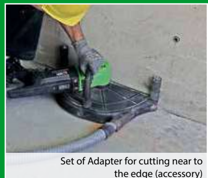
Set of Adapter for cutting near to the edge (accessory)