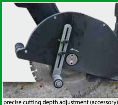
precise cutting depth adjustment (accessory)